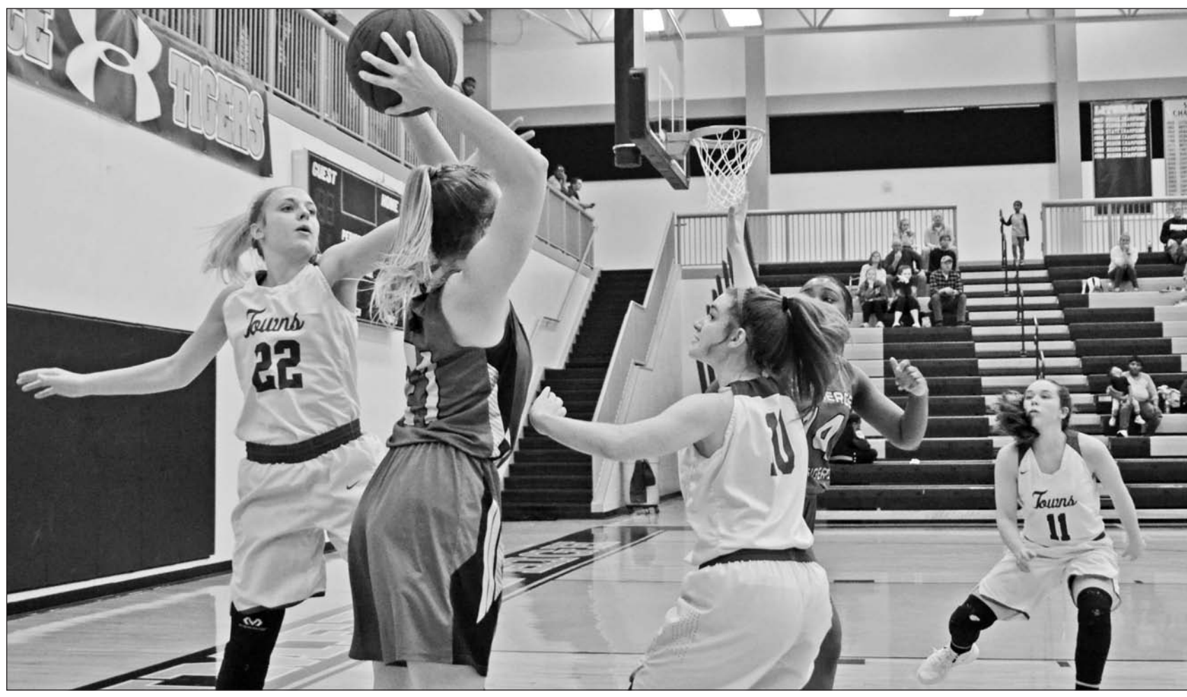
The Towns County Lady Indians in action vs Commerce during the opening round of last week's Region 8-A Tournament.

game. lier games often learns a lot with the win before falling to