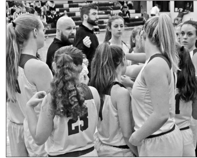
Towns County is the No. 14 seed in the upcoming Class A Public State Tournament.

Just a slight change brought about by the appeals process could result in the Lady Indians facing Lake Oconee Academy, a charter school from Greensboro near Athens, and an unlikely drastic change might bring about a still different